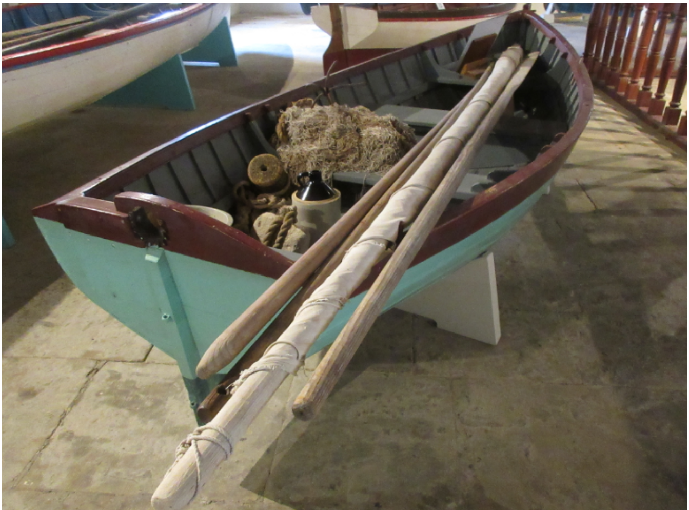
“Magic” a former working Bermuda dinghy built of cedar and used by the Hayward family of St. David’s for turtle fishing

The museum has a boat loft that contains some notable Bermuda small craft including Bermuda dinghies. The dinghies date from the 1850s and were originally family boats built of native Bermuda cedar and used for local transport or fishing within the harbors and along the shoreline.