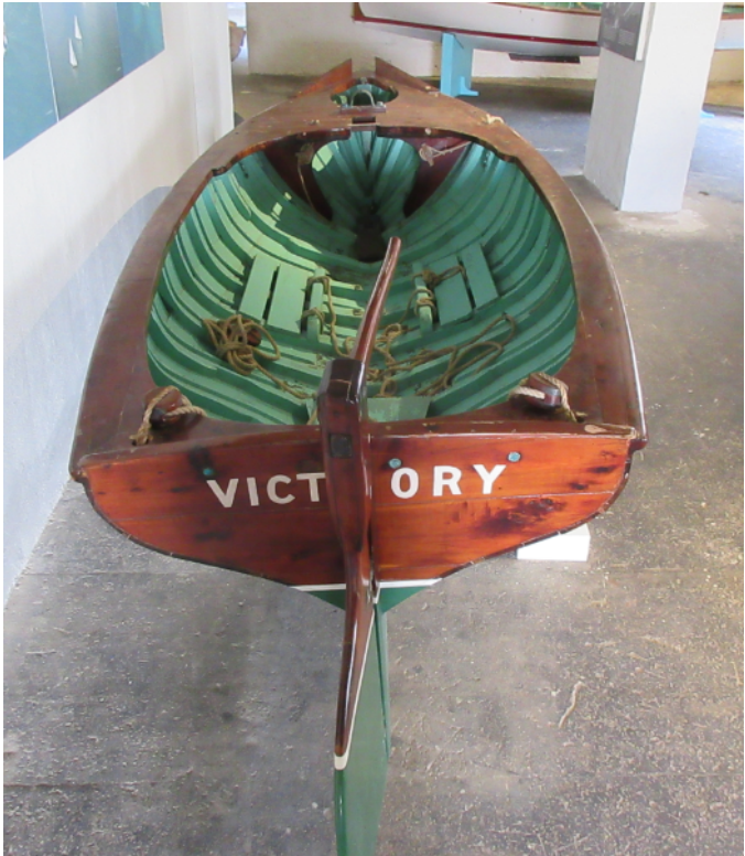
Bermuda Dinghy "Victory" built in 1885 and winner of numerous races