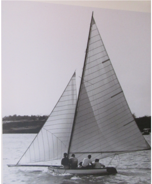
"Victory" under sail and manned by a crew from St. George's