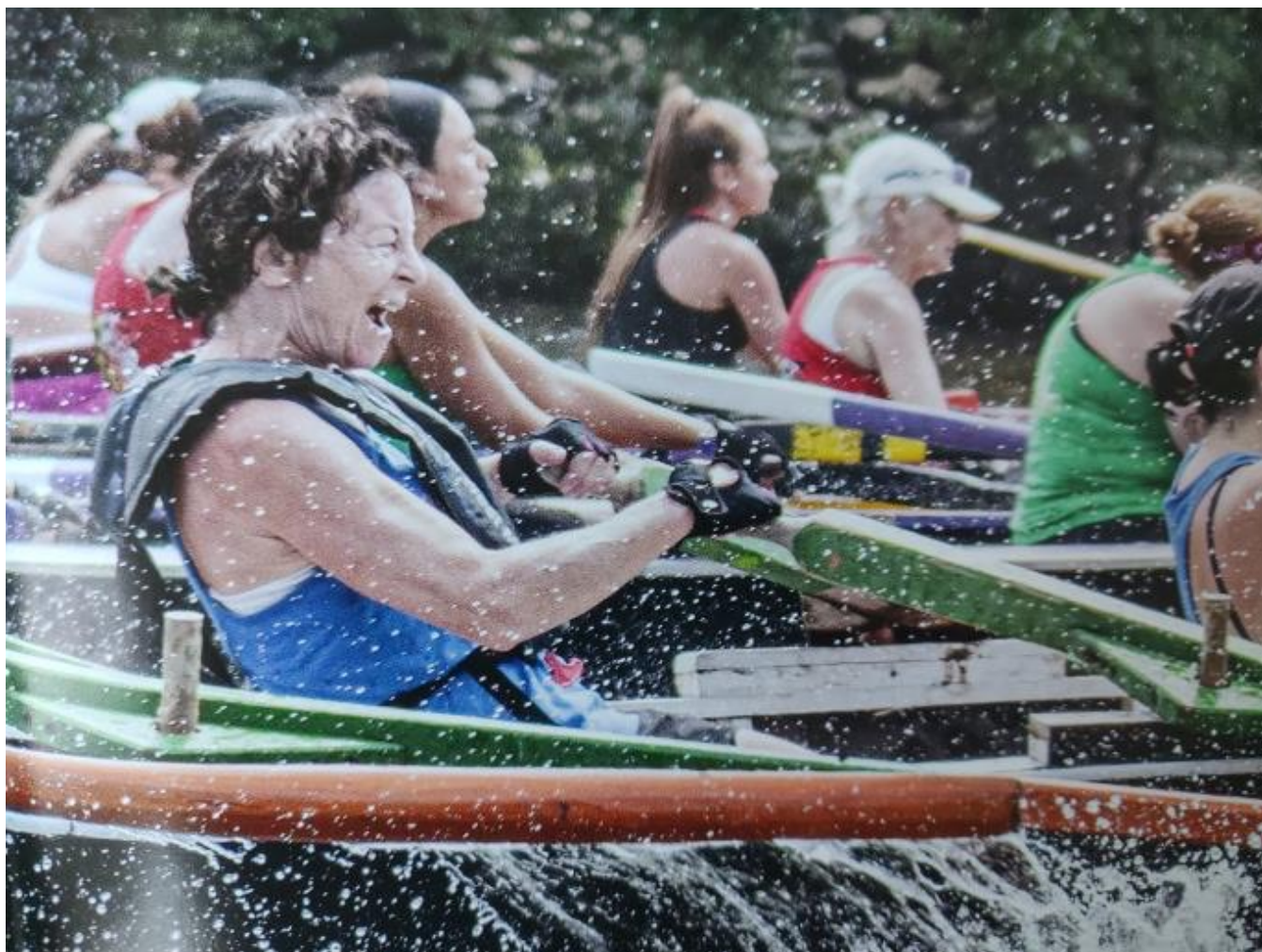
The thrill of currach racing