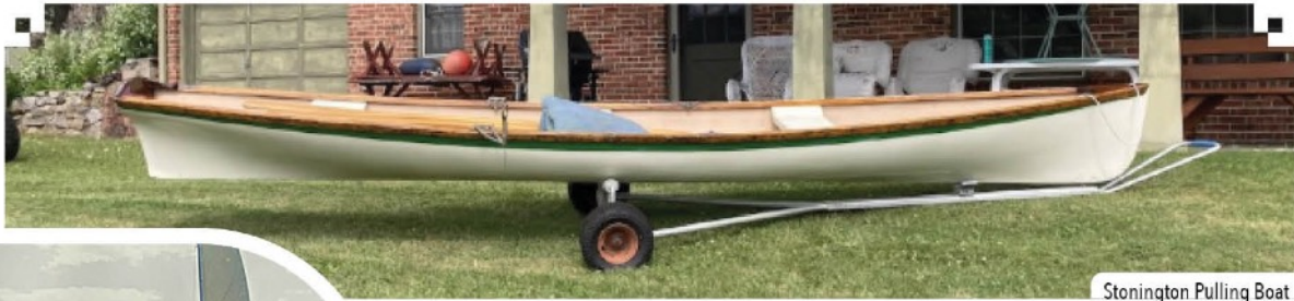
Stonington Pulling Boat