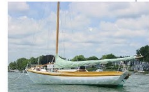
Herrshoff Fish Class