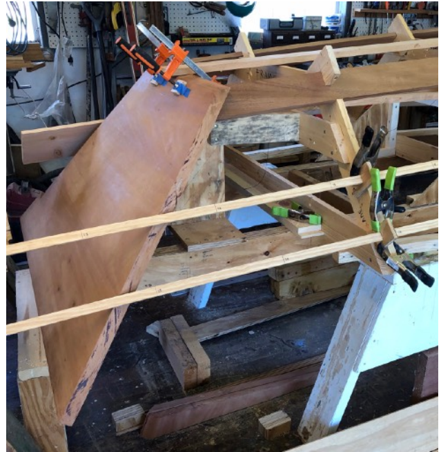
Permanent transom in place