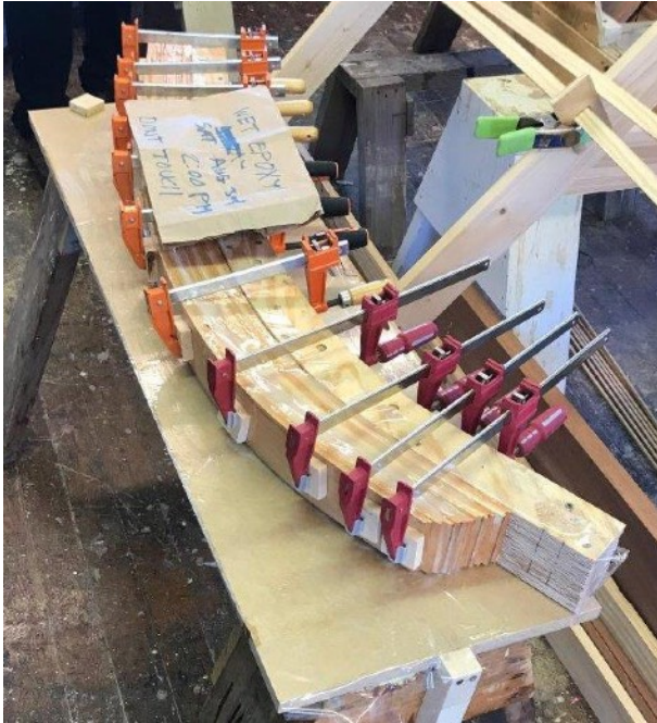
Laminating the Stem