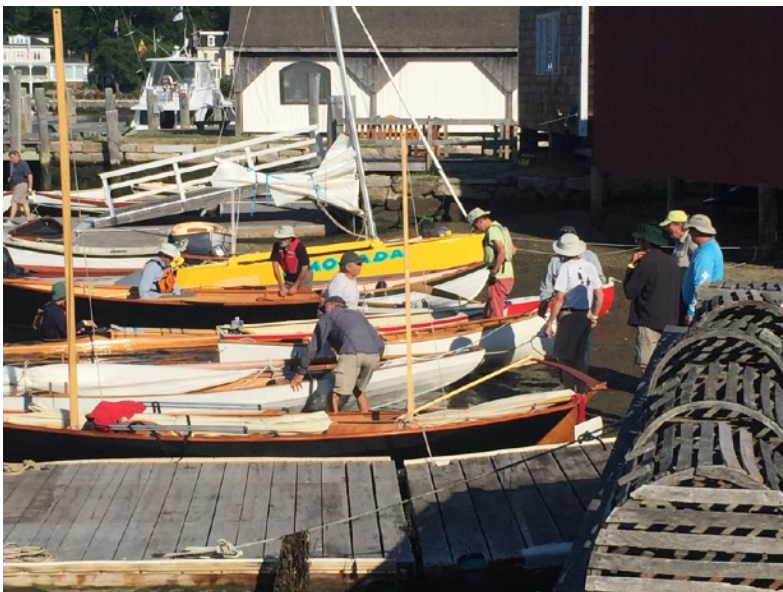
Exhibit Center. The Exhibit draws rich human interest stories from the Museum’s collection of more than 450 small watercraft through which we will be offering guided tours Saturday and Sunday afternoons.